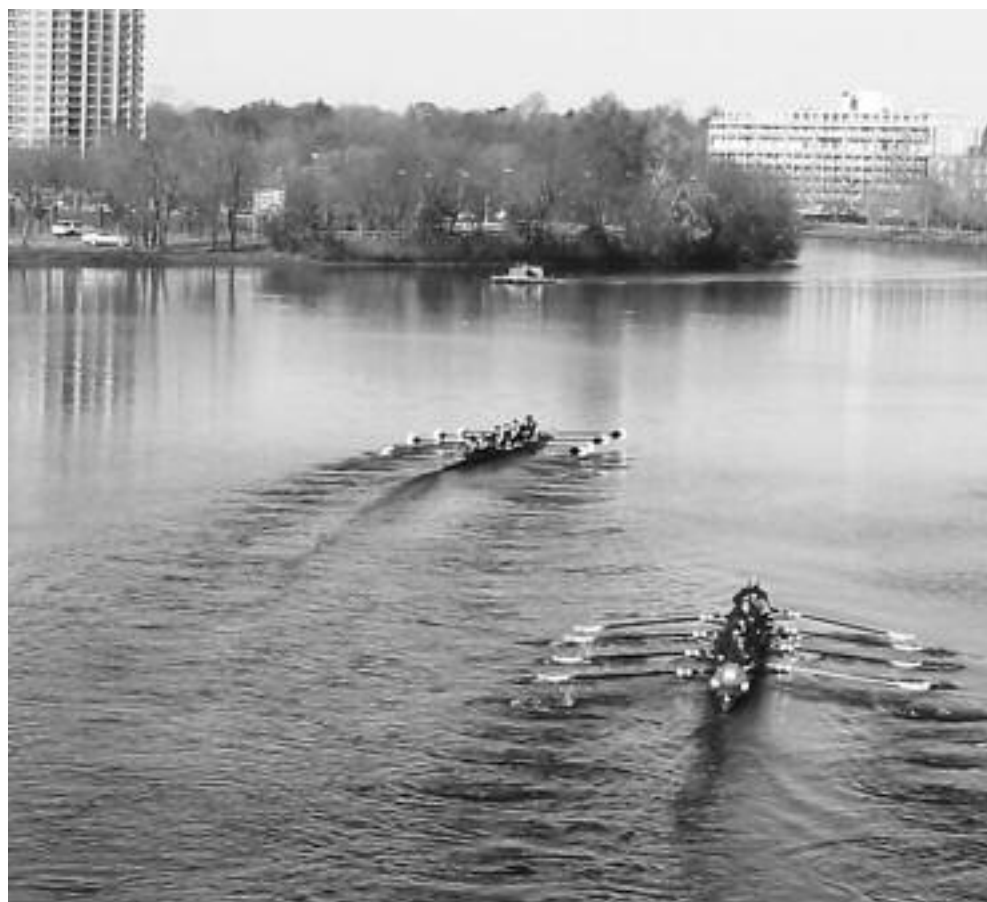
MIT Varsity Lightweight Women closing in on Radcliffe at the finish of the Foot of the Charles 2005

Editor's note: We have sent the fall edition of "Squaring the Blade" later than normal this year to include the Head of the Charles results and an article about the annual banquet.