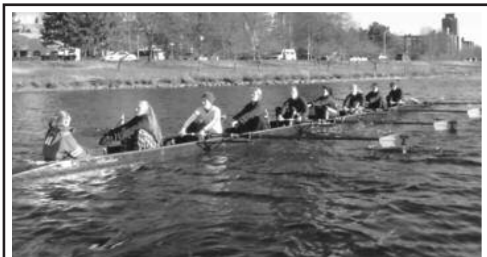
Women's openweight novices in the fall

"From his first strokes in the fall of 1937 to his last year of coaching in 1991 he remained a passionate rower, coach and patron."