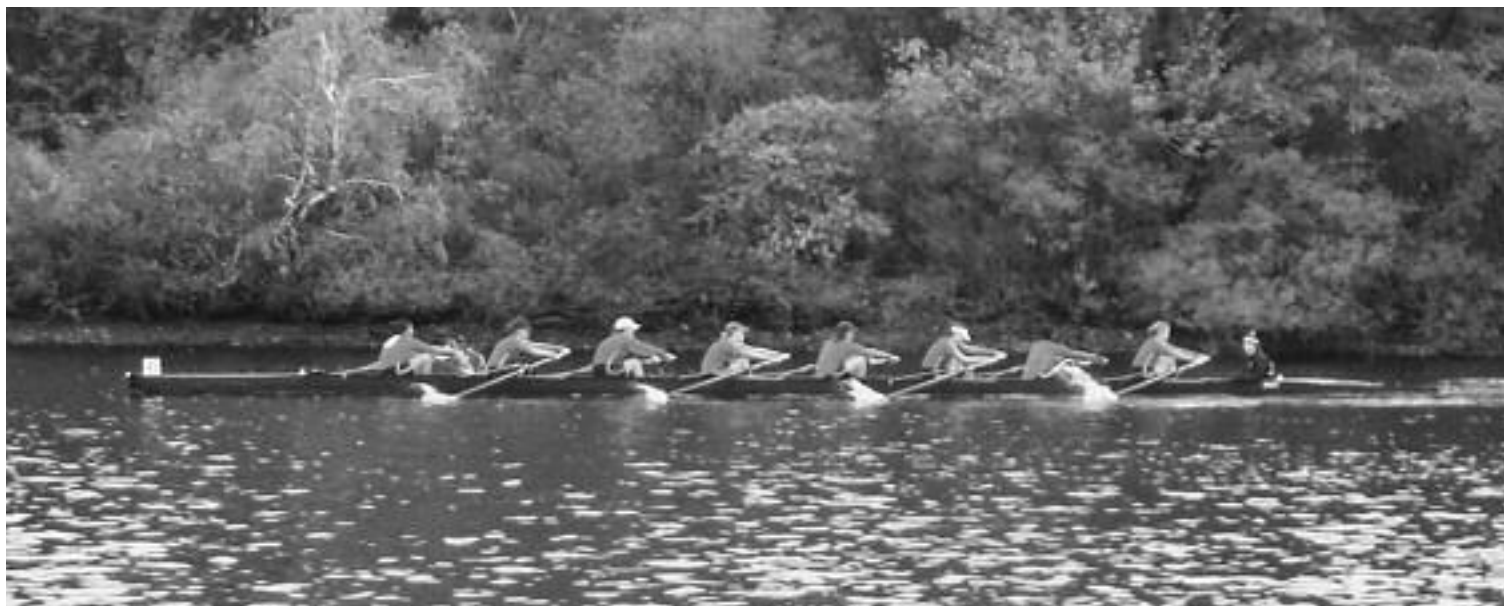
The MIT Women's Openweight 8 from the Head of the Charles. They competed in the Collegiate Women's Eight Event and placed 28th out of 46 competitors.