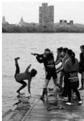
Far left: MIT Novice Lightweights beating Radcliffe; Middle left: Lightweights getting ready to launch; Left: Coxswain goes for a swim.